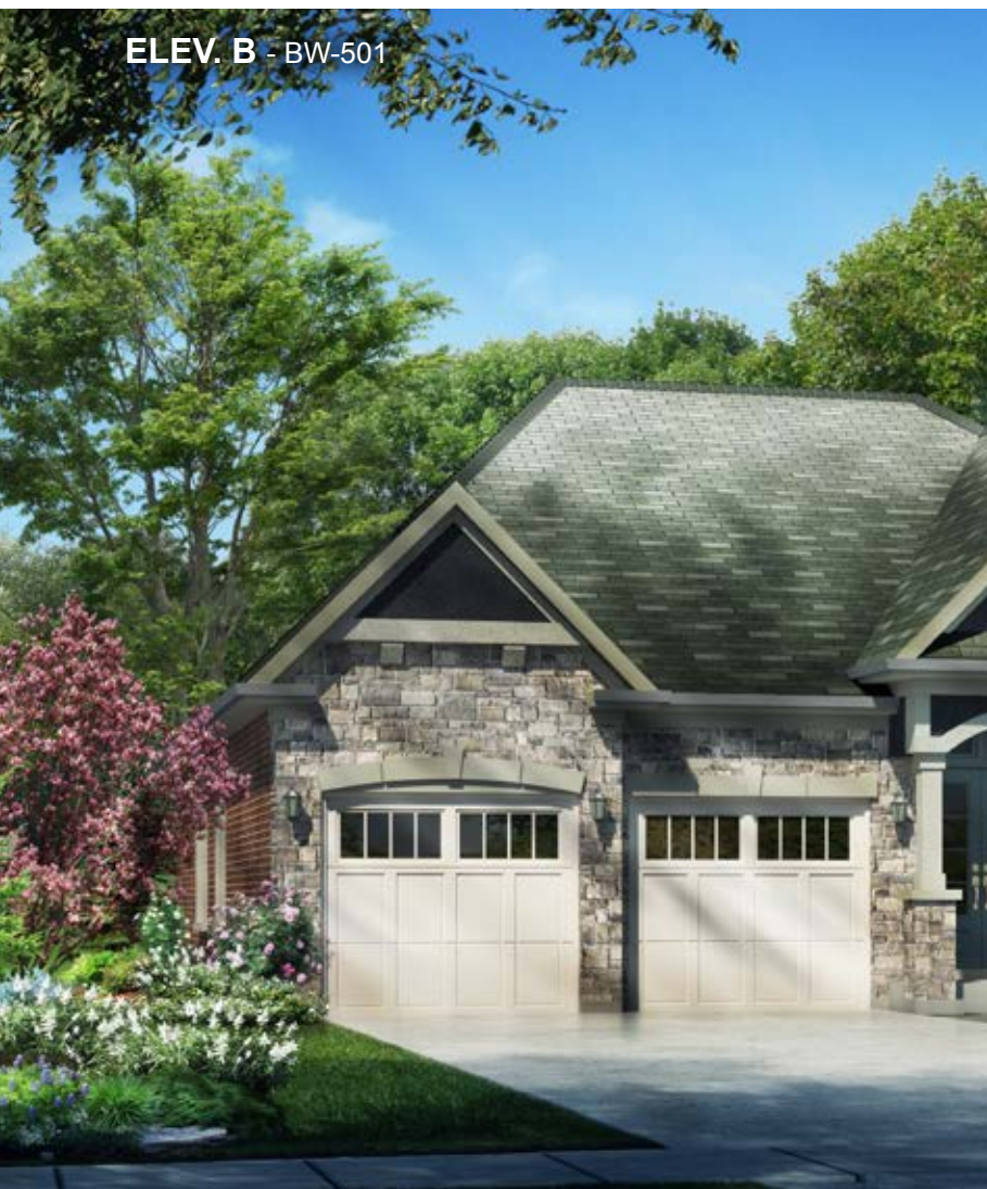
ELEV. B - BW-501