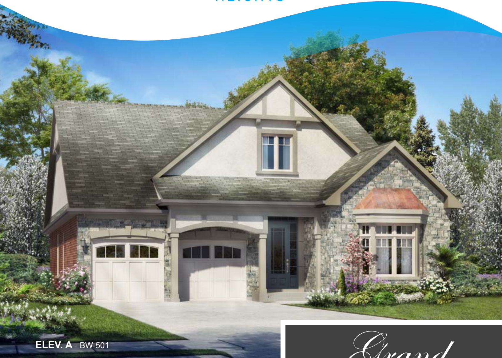
ELEV. A - BW-501